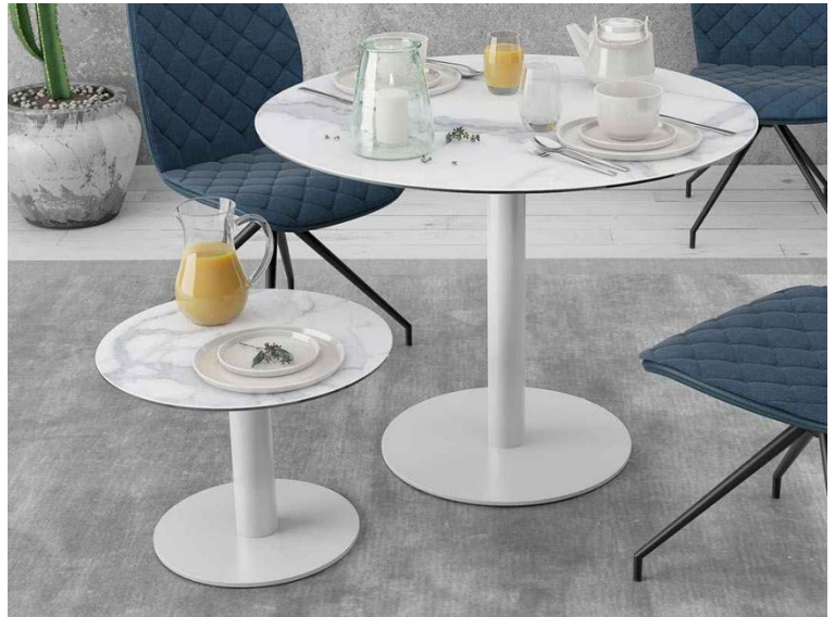
Table tops are ceramic (ceramic plate 3 mm thick glued upon a 8 mm glass pane) available in 6 finishes: Marquina Marble, Silver, Titanium, Steel Dark, Argile or Matt Marble.

The table legs are made of matt black lacquered steel.