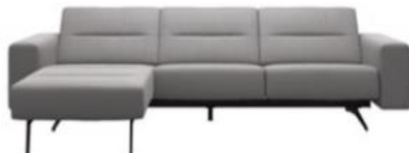
2 Seater w Longseat (M)