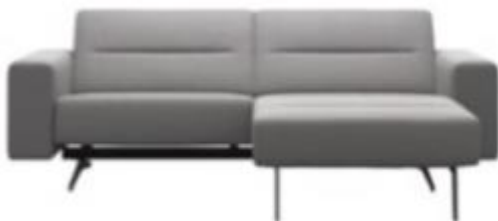
1.25 Seater w Longseat (L)