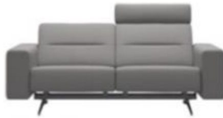
2 Seater w headrest