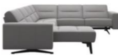
C22 w Longseat (M)