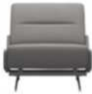
1 Seater (with side panels only)