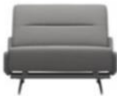
1.25 Seater (with side panels only)