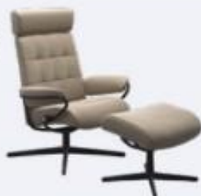
Adjustable Headrest Cross