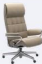
High Back Home Office