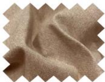
Soft Pink 0437