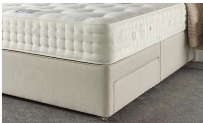
Padded top divan | featuring silver castors Height = 41.5cm

Padded top divans provide a firmer feel. Drawer options upgrades available with this base. All drawers are assembled from solid hardwood components, using dovetail joints for strength, and feature smooth operation ball bearing drawer runners.