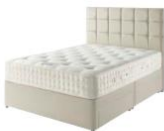
2 Large drawer set

To allow you to add valuable storage to your room Relyon offers two different drawer options on the padded top divan. If you do not require a divan with drawers we also offer non storage options.