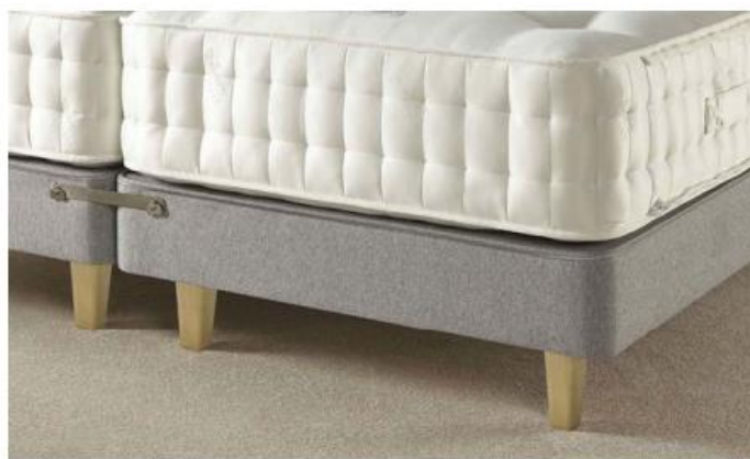
Padded top divan on legs | featuring beech legs Height = 35cm

Padded top divans provide a firmer feel. Drawer options upgrades available with this base. All drawers are assembled from solid hardwood components, using dovetail joints for strength, and feature smooth operation ball bearing drawer runners.