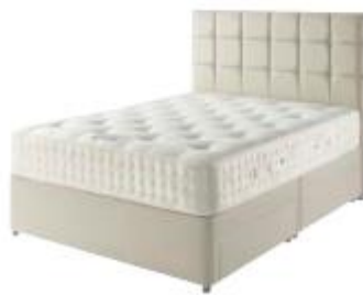
2 Large drawer set

To allow you to add valuable storage to your room Relyon offers two different drawer options on the padded top divan. If you do not require a divan with drawers we also offer non storage options.