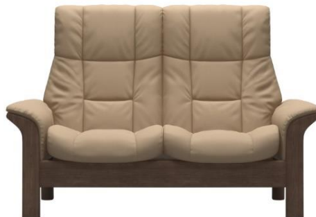
W 149 x H 103 x D 79cm