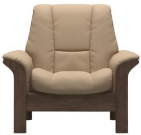
W 94 x H 87 x D 79cm

Stressless Windsor features low back and high back models for comfort and luxury in leather – wide choice of colours. Both adjust to follow your body movements perfectly. The recliner has neck support and a full reclining action.