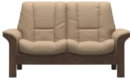
W 149 x H 87 x D 79cm