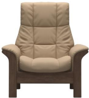
W 94 x H 103 x D 79cm