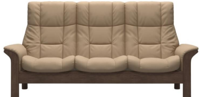
W 204 x H 103 x D 79cm