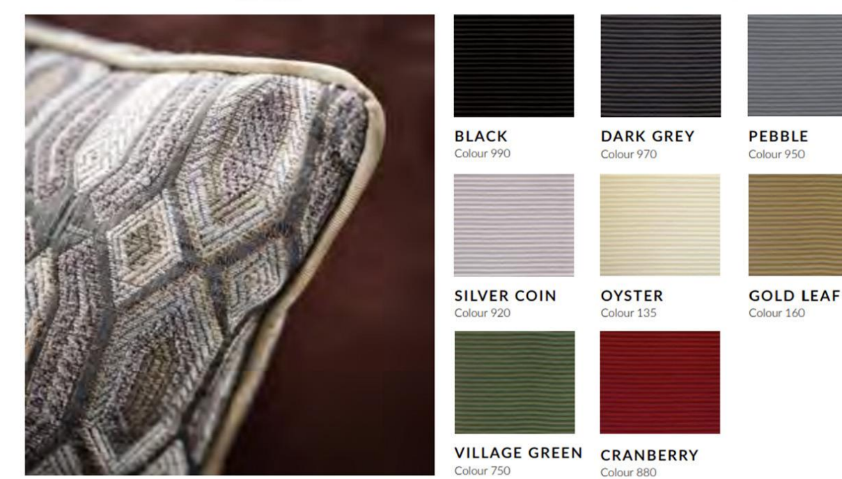
Grosgrain piping shown in Gold Leaf (Colour 160).

Grosgrain is a 100% polyester ribbon. Grosgrain piping can be selected as contrast piping for your sofa, footstool and/or scatters, and is suitable for use as piping only.